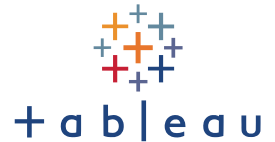
Tableau Software Inc Rank 46 of 120

The relative strengths and weaknesses of Tableau Software Inc are analyzed with respect to the market average, including all of its competitors. We analyzed all variables having an effect on the Economic Capital Ratio.